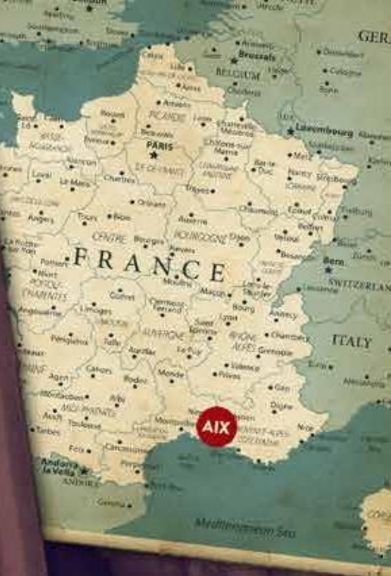
Illustration by Ariel Osif MFA